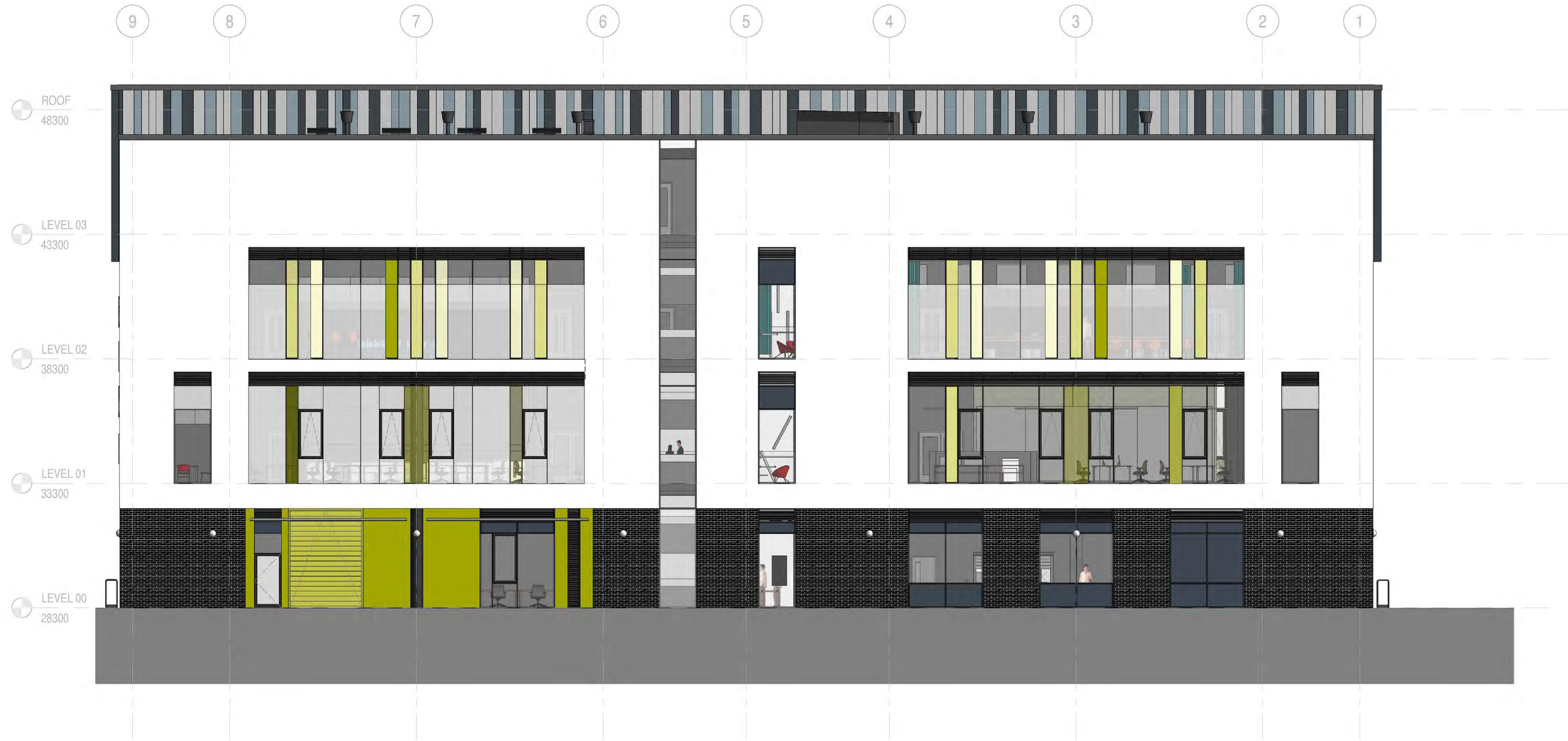
1 ELEVATION EAST 1 : 100